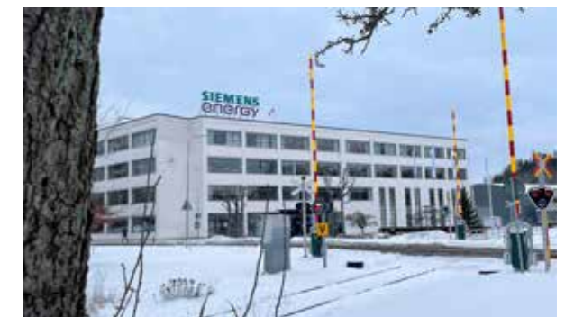
The Siemens headquarters in central Finspång.

For new residents, Finspång offers both a rich cultural heritage and a modern industrial future. The old ironworks environment is easy to visit, and it provides a meaningful introduction to how the town grew through craft, innovation, and cooperation across borders. This combination continues to shape Finspång today, as a diverse and forward-looking community.