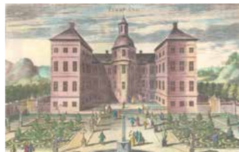
Finspång Castle seen from the garden. Colored copper engraving by Johannes van den Aveelen, 1715.

For centuries, Finspång developed around its iron industry and the estate at Finspång Castle. The historic ironworks area reflects the close relationship between production, craftsmanship, and everyday life. From cannon casting to ironworking, this industrial legacy reveals the forces and skills that shaped Finspång's character over time.